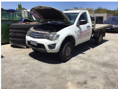
Picture Of The Vehicle

VEHICLE REGISTRATION? Triton 1DIU447 WHAT IS THE CURRENT MILEAGE ? 217,908 WHEN IS THE NEXT SERVICE DUE? 224,000 CHECK IF SPILL MANAGEMENT FOLDER IS IN THE TRUCK? Yes