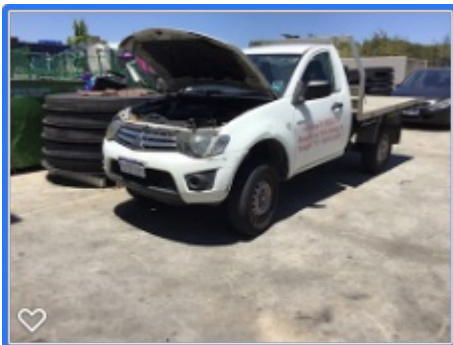
Picture Of The Vehicle

VEHICLE REGISTRATION? Triton 1DIU447 WHAT IS THE CURRENT MILEAGE ? 217425 WHEN IS THE NEXT SERVICE DUE? 224000 CHECK IF SPILL MANAGEMENT FOLDER IS IN THE TRUCK? Yes