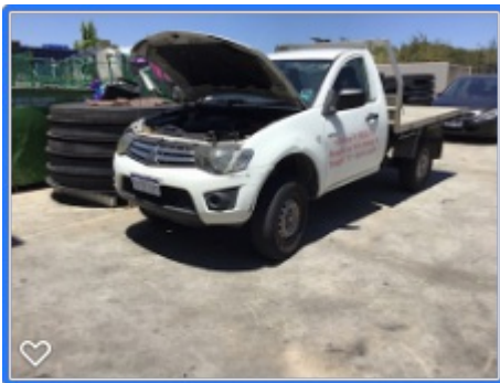
Picture Of The Vehicle

VEHICLE REGISTRATION? Triton 1DIU447 WHAT IS THE CURRENT MILEAGE ? 217994 WHEN IS THE NEXT SERVICE DUE? 224000 CHECK IF SPILL MANAGEMENT FOLDER IS IN THE TRUCK? Yes