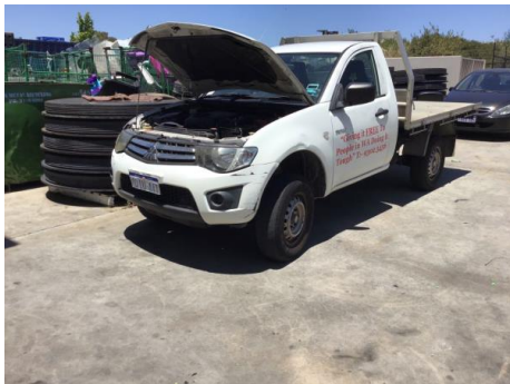
Picture Of The Vehicle

VEHICLE REGISTRATION? Triton 1DIU447 WHAT IS THE CURRENT MILEAGE ? 219114 WHEN IS THE NEXT SERVICE DUE? 224000 CHECK IF SPILL MANAGEMENT FOLDER IS IN THE TRUCK? Yes