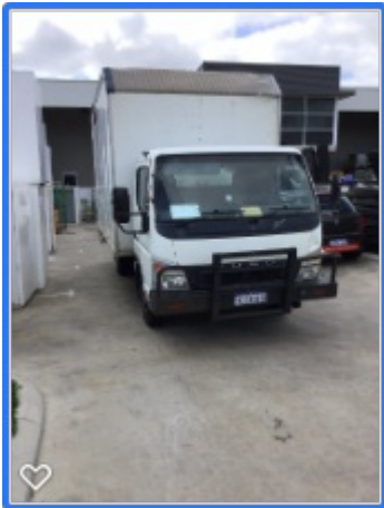
Picture Of The Vehicle

VEHICLE REGISTRATION? Truck 4 Canter 1CEM814 WHAT IS THE CURRENT MILEAGE ? 355,935 WHEN IS THE NEXT SERVICE DUE? 360,700 CHECK IF SPILL MANAGEMENT FOLDER IS IN THE TRUCK? Yes