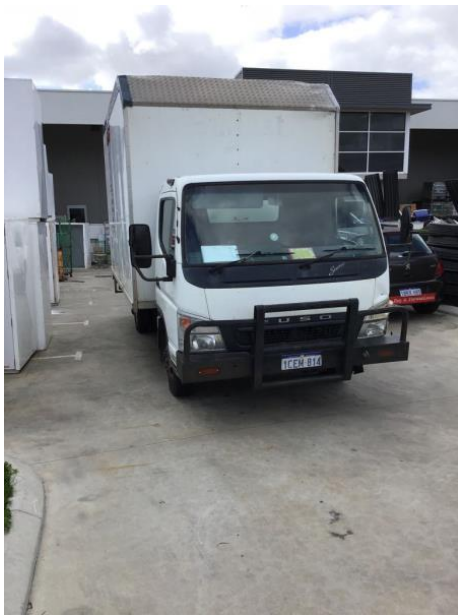
Picture Of The Vehicle

VEHICLE REGISTRATION? Truck 4 Canter 1CEM814 WHAT IS THE CURRENT MILEAGE ? 335,468 WHEN IS THE NEXT SERVICE DUE? 336,000 CHECK IF SPILL MANAGEMENT FOLDER IS IN THE TRUCK? Yes