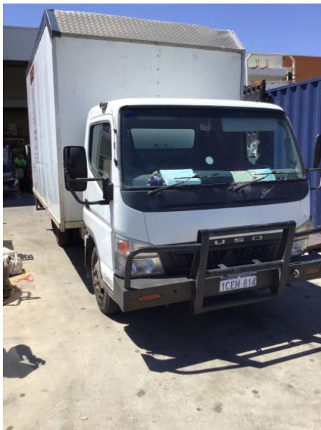
Picture Of The Vehicle

VEHICLE REGISTRATION? Truck 4 Canter 1CEM814 WHAT IS THE CURRENT MILEAGE ? 338,779 WHEN IS THE NEXT SERVICE DUE? 346,000 CHECK IF SPILL MANAGEMENT FOLDER IS IN THE TRUCK? Yes