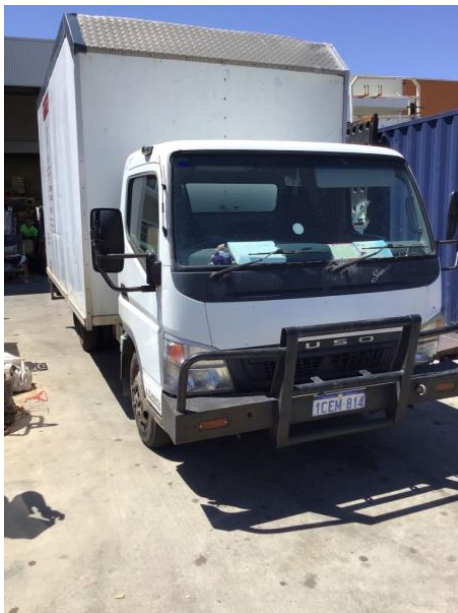
Picture Of The Vehicle

VEHICLE REGISTRATION? Truck 4 Canter 1CEM814 WHAT IS THE CURRENT MILEAGE ? 341,060 WHEN IS THE NEXT SERVICE DUE? 346,000 CHECK IF SPILL MANAGEMENT FOLDER IS IN THE TRUCK? Yes