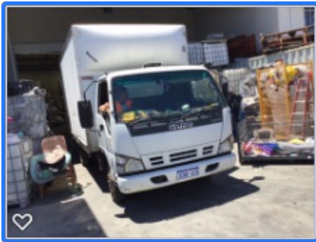
Picture Of The Vehicle

VEHICLE REGISTRATION? Truck 5 Isuzu 1EWMF419 WHAT IS THE CURRENT MILEAGE ? 451,809 WHEN IS THE NEXT SERVICE DUE? 446,000 CHECK IF SPILL MANAGEMENT FOLDER IS IN THE TRUCK? Yes