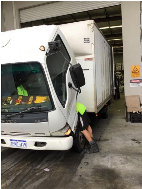
Picture Of The Vehicle

VEHICLE REGISTRATION? Truck 5 Isuzu 1EWMF419