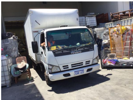
Picture Of The Vehicle

VEHICLE REGISTRATION? Truck 5 Isuzu 1EWMF419 WHAT IS THE CURRENT MILEAGE ? 436,879 WHEN IS THE NEXT SERVICE DUE? 446,000 CHECK IF SPILL MANAGEMENT FOLDER IS IN THE TRUCK? Yes