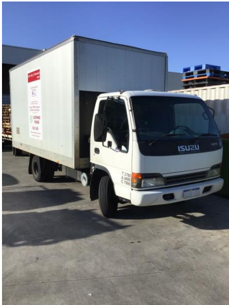
Picture Of The Vehicle