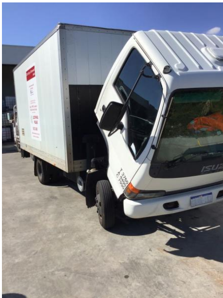
Picture Of The Vehicle

VEHICLE REGISTRATION? Truck 6 1BMN153 WHAT IS THE CURRENT MILEAGE ? 478,094 WHEN IS THE NEXT SERVICE DUE? 483,000 CHECK IF SPILL MANAGEMENT FOLDER IS IN THE TRUCK? Yes