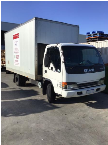
Picture Of The Vehicle

VEHICLE REGISTRATION? Truck 6 1BMN153 WHAT IS THE CURRENT MILEAGE ? 491233 WHEN IS THE NEXT SERVICE DUE? 492,000 CHECK IF SPILL MANAGEMENT FOLDER IS IN THE TRUCK? Yes