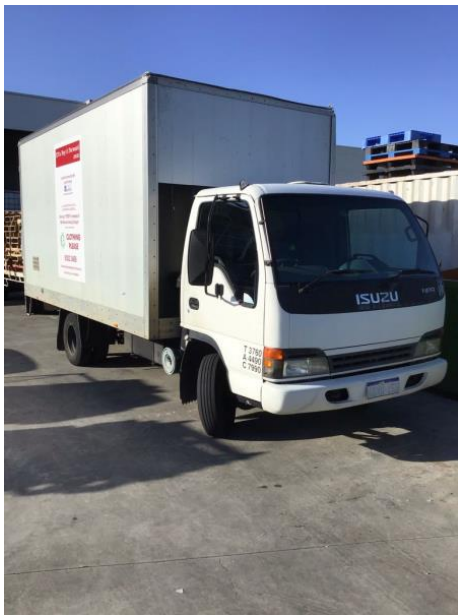
Picture Of The Vehicle

VEHICLE REGISTRATION? Truck 6 1BMN153 WHAT IS THE CURRENT MILEAGE ? 492842 WHEN IS THE NEXT SERVICE DUE? 493,000 service CHECK IF SPILL MANAGEMENT FOLDER IS IN THE TRUCK? Yes