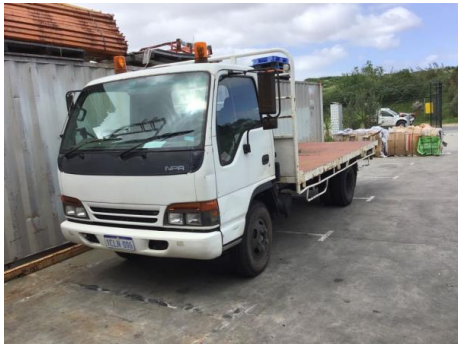
Picture Of The Vehicle

VEHICLE REGISTRATION? Truck 8 Isuzu Deli 1CLN006