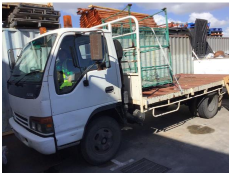
Picture Of The Vehicle

VEHICLE REGISTRATION? Truck 8 Isuzu Deli 1CLN006 WHAT IS THE CURRENT MILEAGE ? 521,759 WHEN IS THE NEXT SERVICE DUE? 522,500 CHECK IF SPILL MANAGEMENT FOLDER IS IN THE TRUCK? Yes