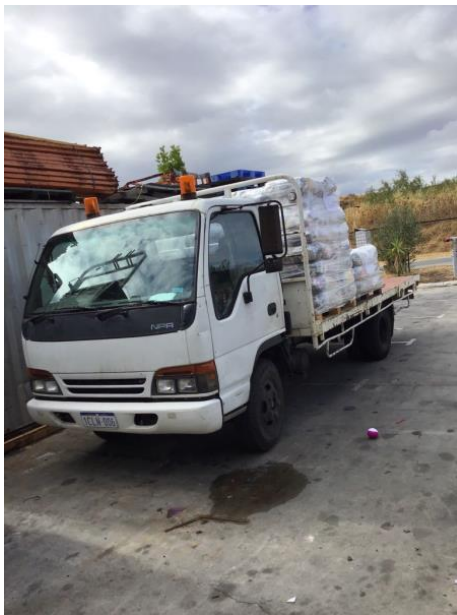
Picture Of The Vehicle

VEHICLE REGISTRATION? Truck 8 Isuzu Deli 1CLN006 WHAT IS THE CURRENT MILEAGE ? 525,787 WHEN IS THE NEXT SERVICE DUE? 532,000 CHECK IF SPILL MANAGEMENT FOLDER IS IN THE TRUCK? Yes