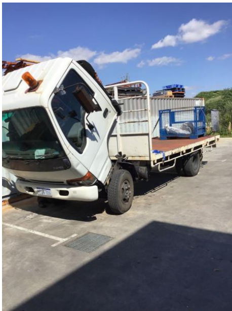
Picture Of The Vehicle

VEHICLE REGISTRATION? Truck 8 Isuzu Deli 1CLN006 WHAT IS THE CURRENT MILEAGE ? 519,206 WHEN IS THE NEXT SERVICE DUE? 522.500 CHECK IF SPILL MANAGEMENT FOLDER IS IN THE TRUCK? Yes