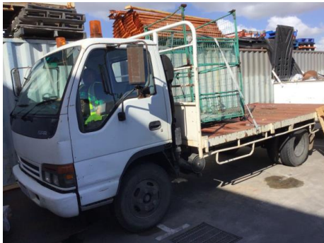
Picture Of The Vehicle

VEHICLE REGISTRATION? Truck 8 Isuzu Deli 1CLN006