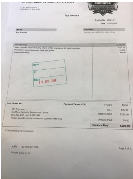
Picture Of The Receipt

DATE OF JOB DONE 23/07/2018 VEHICLE REGISTRATION? Peugeot 308 1BRX685 DESCRIPTION OF WORK DONE Mnor 4 Cylinder Service PI NUMBER 3795 VALUE OF WORK DONE 220