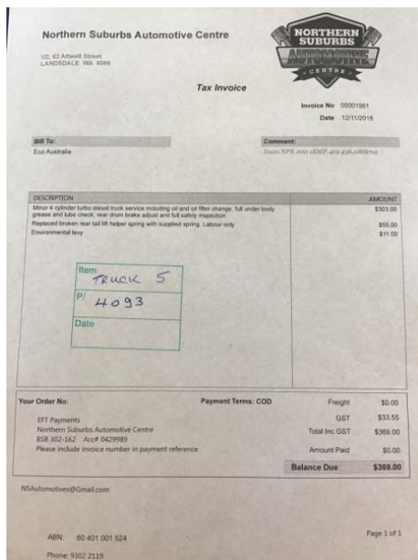
Picture Of The Receipt

DATE OF JOB DONE 12/11/2018 VEHICLE REGISTRATION? Truck 5 Isuzu 1EMMF419 DESCRIPTION OF WORK DONE Mnor Diesel Truck Service PI NUMBER 4093 VALUE OF WORK DONE 369.00