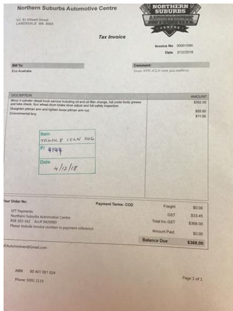
Picture Of The Receipt

DATE OF JOB DONE 03/12/2018 VEHICLE REGISTRATION? Truck 8 Isuzu Deli 1CLN006 DESCRIPTION OF WORK DONE Minor 4 Cyl Service oil & Filter change also straighten pitman arm and relighted bolts as required PI NUMBER 4144 VALUE OF WORK DONE 368.00