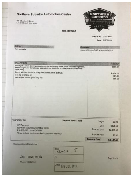
Picture Of The Receipt

DATE OF JOB DONE 05/07/2018 VEHICLE REGISTRATION? Truck 5 Isuzu 1EMMF419 DESCRIPTION OF WORK DONE Investigate lack of power, Found to be Bearing on Turbo unit, Fitted new Garrett turbo unit, cleaned out oil and Debris from intake pipes and inter cooler PI NUMBER 3797 VALUE OF WORK DONE -