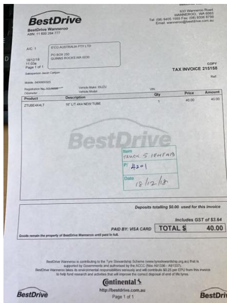
Picture Of The Receipt

DATE OF JOB DONE 18/12/2018 VEHICLE REGISTRATION? Truck 5 Isuzu 1EMMF419 DESCRIPTION OF WORK DONE Puncture Repair PI NUMBER 4201 VALUE OF WORK DONE -