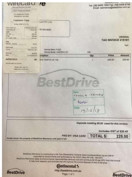
Picture Of The Receipt

DATE OF JOB DONE 19/12/2018 VEHICLE REGISTRATION? Truck 4 Canter 1CEM814 DESCRIPTION OF WORK DONE Replacement of front tyre PI NUMBER 4202 VALUE OF WORK DONE -