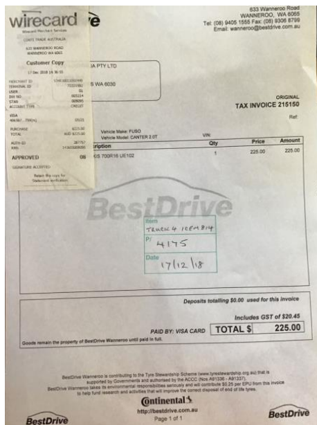
Picture Of The Receipt

DATE OF JOB DONE 17/12/2018 VEHICLE REGISTRATION? Truck 4 Canter 1CEM814 DESCRIPTION OF WORK DONE Replacement of front tyre PI NUMBER 4175 VALUE OF WORK DONE -