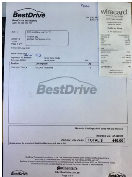
Picture Of The Receipt

DATE OF JOB DONE 01/02/2019 VEHICLE REGISTRATION? Truck 6 1BMN153 DESCRIPTION OF WORK DONE Replacement of two Front Tyres PI NUMBER P4267 VALUE OF WORK DONE -