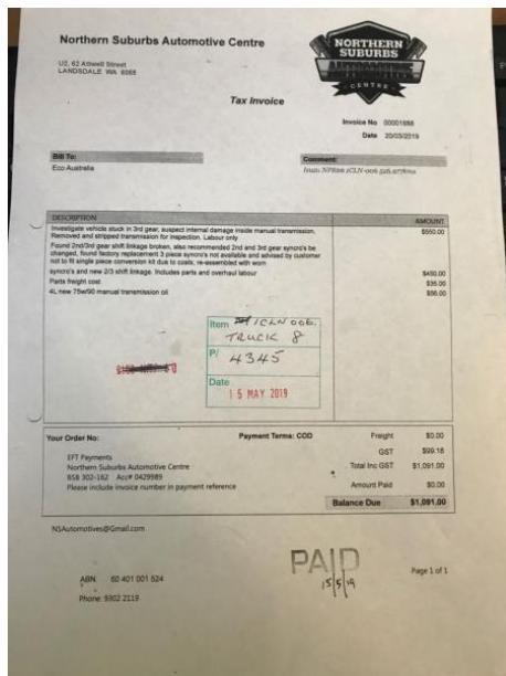
Picture Of The Receipt

DATE OF JOB DONE 20/03/2019 VEHICLE REGISTRATION? Truck 8 Isuzu Deli 1CLN006 Vin JAANFR66LV7102319 Engine 4HF1502526 Year 1997 DESCRIPTION OF WORK DONE Investigate vehicle stuck in 3rd gear Found to be gear shift linkage broken PI NUMBER 4345 VALUE OF WORK DONE 1,000.00