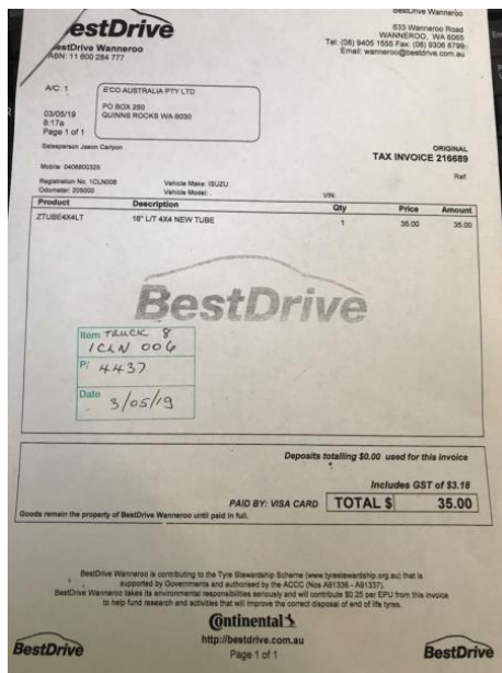
Picture Of The Receipt

DATE OF JOB DONE 03/05/2019 VEHICLE REGISTRATION? Truck 8 Isuzu Deli 1CLN006 Vin JAANFR66LV7102319 Engine 4HF1502526 Year 1997 DESCRIPTION OF WORK DONE Replaced new Inner Tube PI NUMBER 4437 VALUE OF WORK DONE -