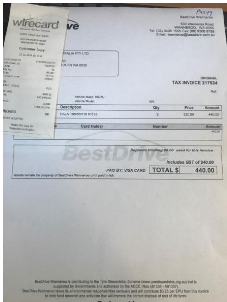
Picture Of The Receipt

DATE OF JOB DONE 05/07/2019 VEHICLE REGISTRATION? Truck 6 Isuzi Truck 1BMN 153 Vin JAANPR70L37102230 Year 2003 DESCRIPTION OF WORK DONE Replace 2 Front Tyres as worn to limit PI NUMBER 4579 VALUE OF WORK DONE -