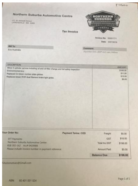
Picture Of The Receipt

DATE OF JOB DONE 05/07/2019 VEHICLE REGISTRATION? Hyundai Getz 1BYR453 DESCRIPTION OF WORK DONE Mnor 4 Cyl service PI NUMBER 4600 VALUE OF WORK DONE 179.00