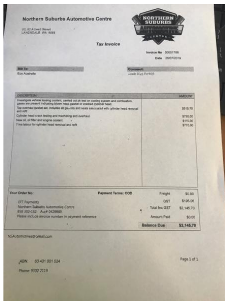
Picture Of The Receipt

DATE OF JOB DONE 26/07/2019 VEHICLE REGISTRATION? Linde Fork Truck 1 DESCRIPTION OF WORK DONE Omg vehicle losing coolant, Top overhaul & removal of cylinder head and refit and test. PI NUMBER 4618 VALUE OF WORK DONE 2,035.70