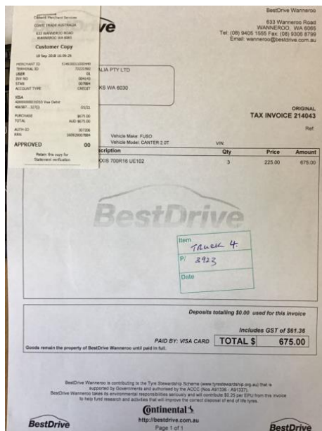
Picture Of The Receipt

DATE OF JOB DONE 18/09/2018 VEHICLE REGISTRATION? Truck 4 Canter 1CEM814 DESCRIPTION OF WORK DONE Replacement of 3 Truck Tyres PI NUMBER 3923 VALUE OF WORK DONE -