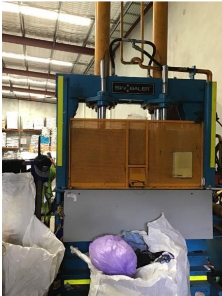
Take a photo of the machine and general work area.

DID YOU IDENTIFY ANY RISKS OR OPPORTUNITIES (PDCA)?