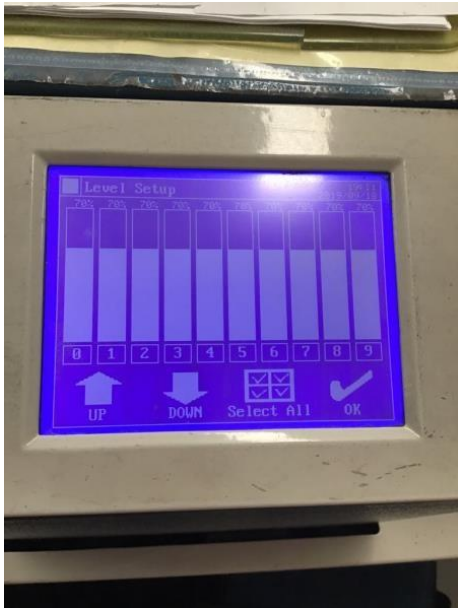
Take a picture of the sensitivity levels of the metal detector