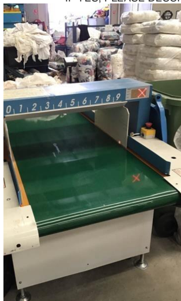
Take a picture of the entire machine