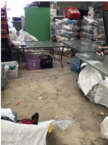
Take a photo of the general working area?